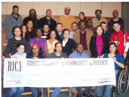
You can protect your liberties in this world only by protecting the other man's freedom. You can be free only if I am free. Clarence Darrow