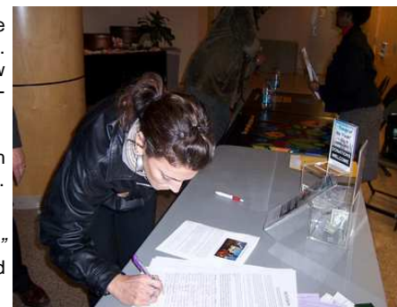
RICJ collecting signatures for Apology for Slavery Legislation following the Bryant University screening.

RICJ submitted a proposal to the Rhode Island Foundation for a strategy grant to create a public awareness campaign around the apology for slavery. RICJ will look to the Rhode Island Council on the Humanities (RICH), the Brown University Steering Committee on Slavery and Justice and to others for assistance with the project.